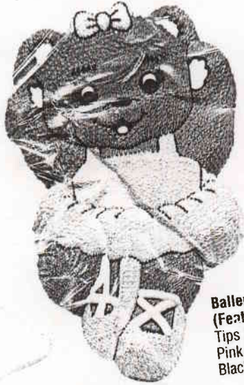
Ballerina Bear (Feature) Tips 3, 16 and Wilton Pink, Brown and Black Icing Colors.

For more decorating ideas and quality products, see the current Wilton Yearbook of Cake Decorating.