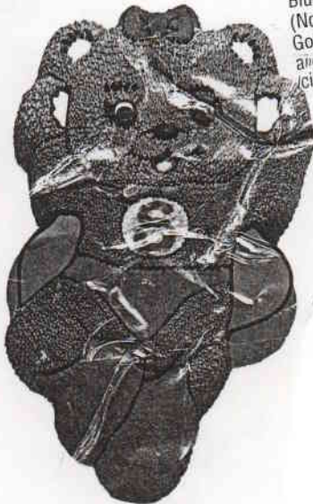
She's Super Tips 3, 16 and Wilton Royal Blue, Brown, Wilton (No-Taste) Red, Golden Yellow, and Black Icing Colors.