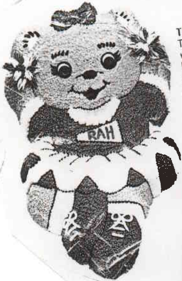
Team Spirit Tips 3, 16, 233 and Wilton Kelly Green, Brown, Golden Yellow, and Black Icing Colors.