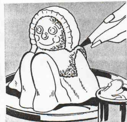
Decorate with bright icing